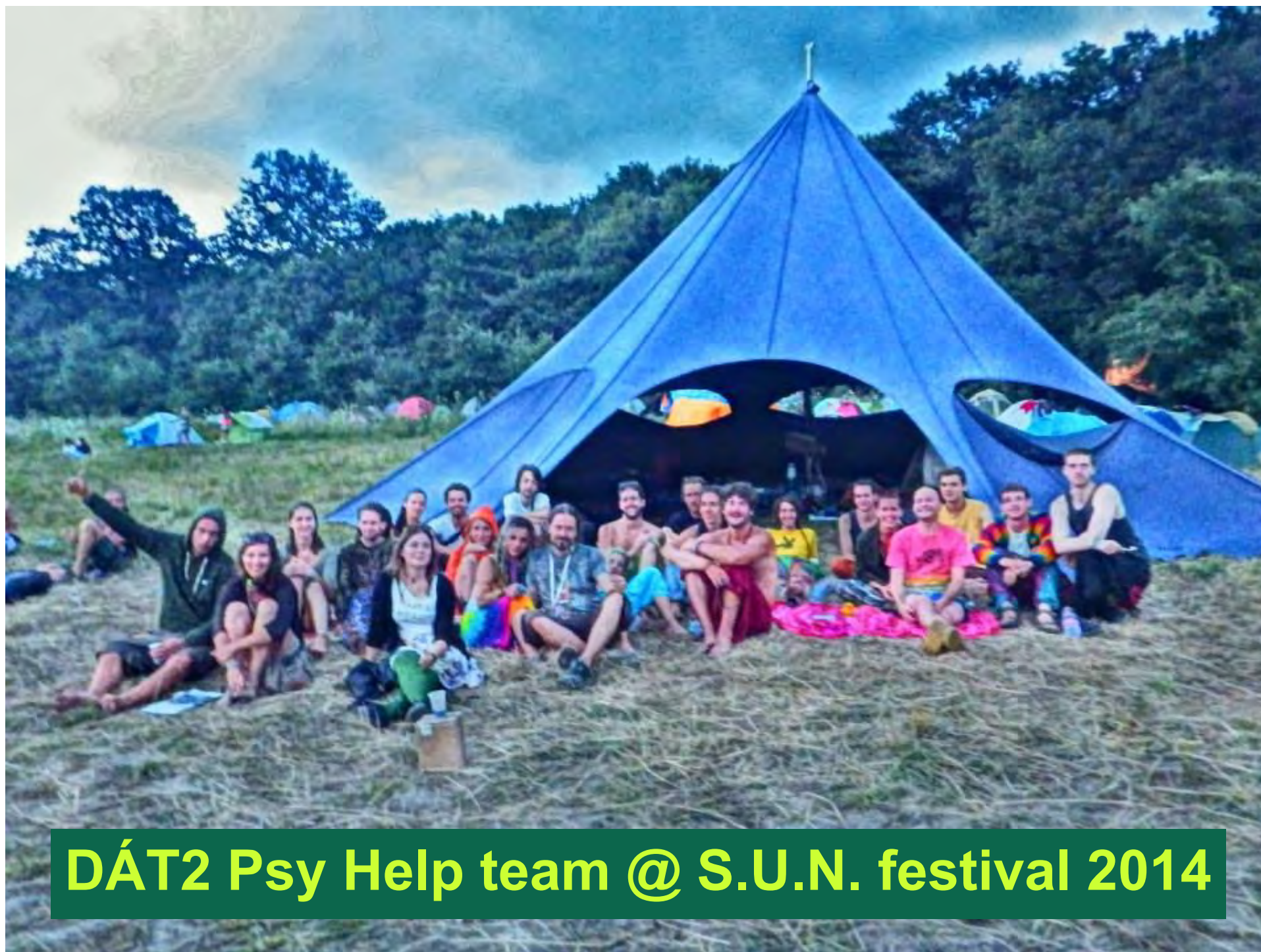
DÁT2 Psy Help team @ S.U.N. festival 2014