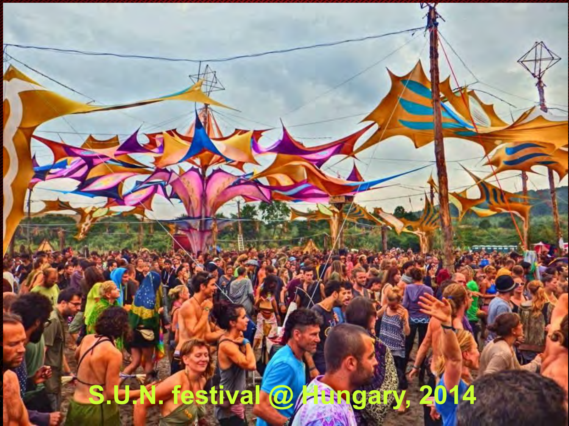
S.U.N. festival @ Hungary, 2014