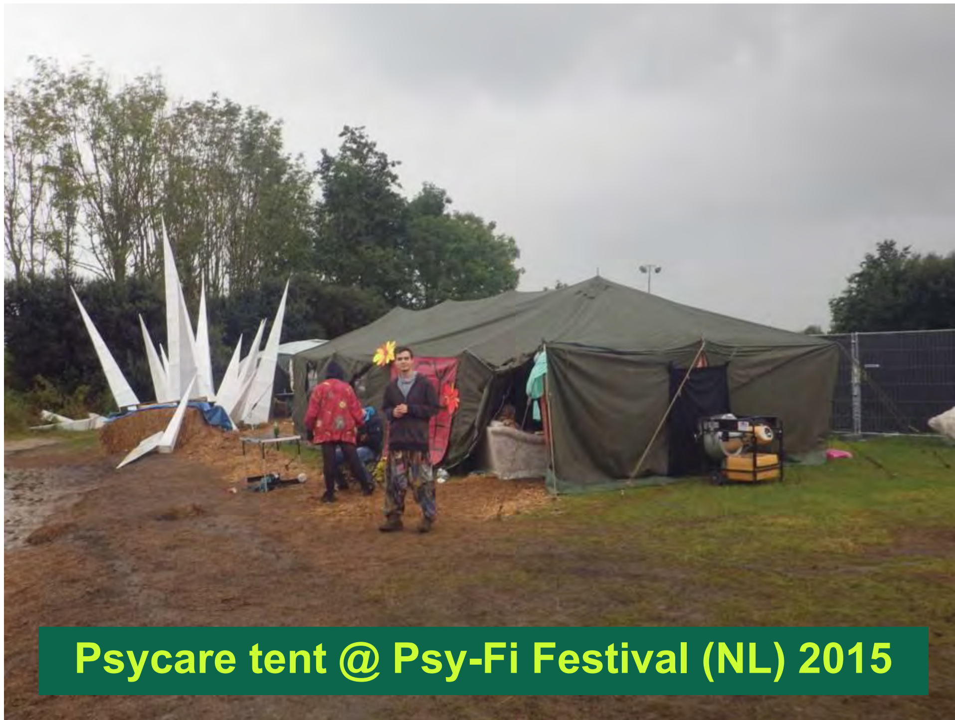
Psycare tent @ Psy-Fi Festival (NL) 2015