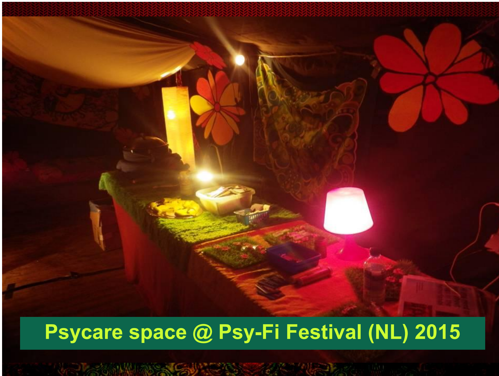
Psycare space @ Psy-Fi Festival (NL) 2015