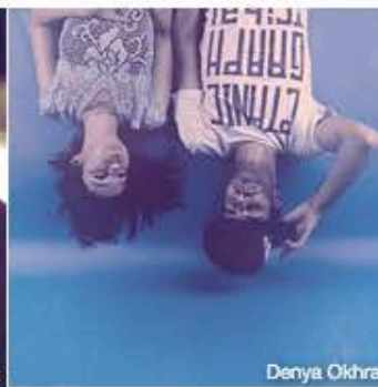
TUNIS DENYA OKHRA STOP IN TIME | WHAT AM I FEELING