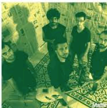
BETHLEHEM MAFAR SADA (ECHO)