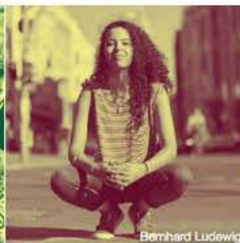
RAMALLAH MAKIMAKKUK EXODUS | RAMALLAH ETAHTA