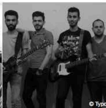
GAZA TYPO TIQLAQISH I ADI