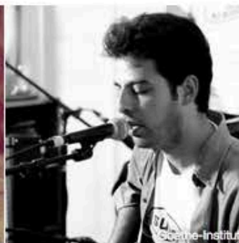
BEIRUT ALKO B HER HEART GETS TO STAY